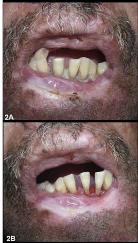
Fig. 2. 2A. Perioral scars, dental plaque due to poor oral hygiene and microstomy. 2B. Oral condition after dental plaque removal using ultrasound.

short stature, difficulty in speaking, and tremors during writing and moving. Oral hygiene was extremely poor due to microstomy (Fig. 2A). During medical history assessment, he reported the removal of three skin lesions nine years before; two of them of facial skin (basal cell carcinoma and actinic keratosis lichenoides) and another one at the chest skin (lentigo simplex) (Fig. 3). The patient had consanguineous parents and a brother with the same disease. Dental and periodontal problems were observed during clinical examination and in panoramic radiograph. An ultrasonic cleaning was performed and limitation to reach the teeth occurred due to microstomy (Fig. 2B). He was instructed to perform proper hygiene of the mouth as well as to keep a rigorous photoprotection on the lips and the rest of the body by using sunscreen moisturizers, wide-brimmed hat and appropriate clothing. Furthermore, the patient was referred to dermatological, neurological and ophthalmological treatment in order to have a multidisciplinary management of the case.